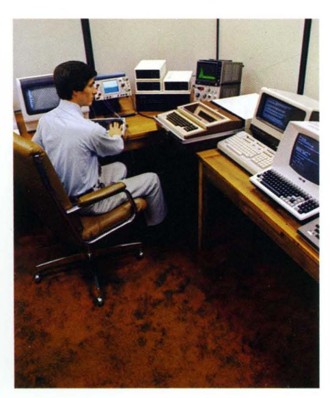
LocalNet is totally vendor-independent, so all the devices you own can communicate with one another.