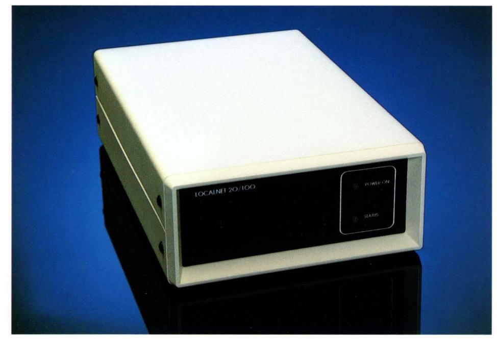
A PCU associated with each LocalNet node handles all intelligent data communications functions.