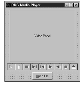
FIGURE 18.3. The DDGMPlay main window.

You can assign a value to TMediaPlayer's Display property to cause the AVI file to play to a specific window, instead of creating its own window. To do this, you add a TPanel component to your Media Player, as shown in Figure 18.3. After adding the panel, you can save the project in a new directory as DDGMPlay.dpr.