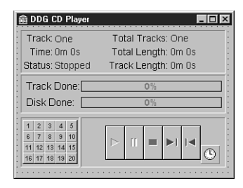
FIGURE 18.4. The audio CD player's main form.

Table 18.2 shows the important properties to be set for the components contained on the CD player's main form.