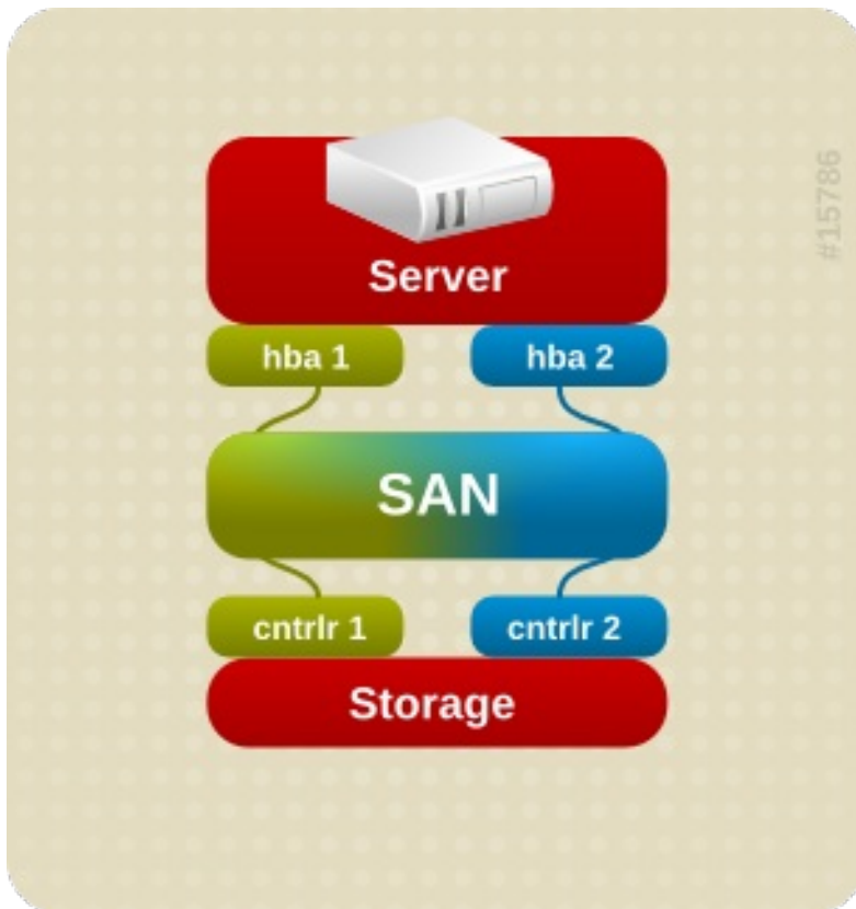
Figure 1.3. Active/Active Multipath Configuration with One RAID Device